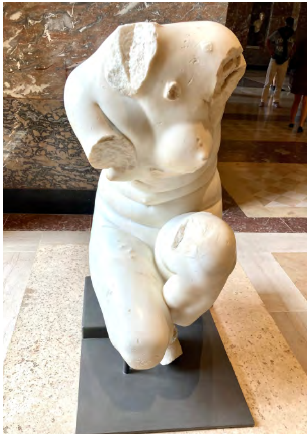
Figure 1: Squatting Aphrodite.

broken, their bodies amputated. And there, before the end of the larger middle room, just to the left of the wall separating you from the Venus de Milo , next to a window, one will see a replica of the Squatting Aphrodite . It is also called the Venus of Vienna , it is quite a compact and round sculpture of a naked woman, coming out of a bath or preparing to go into it.