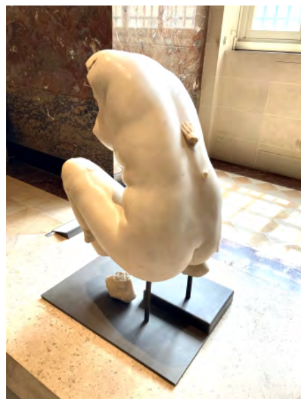
Figure 2: Squatting Aphrodite.

We are here in front of a trashed, wrecked beauty, so unclassical, without pride, and vulnerable. She has been caught during a moment of an ordinary ritual, washing. Her curves are realistic, and contrary to the ideal of harmonious Greek beauty she carries scars of violence and mutilation. Moreover, nobody looks at her. All the visitors rush to the Venus de Milo who is assailed by photos: the visitors form a court around her, standing up to take a picture, aiming their cell phones upwards from below, admiring her immense and imposing figure. Meanwhile, the Squatting Aphrodite , being of human size and due to her posture and her height (it is only 140 cm tall), forces us to bend, to curve our backs, mirroring her posture. And whilst everybody is so busy admiring the Venus de Milo , the Squatting Aphrodite looks lonely. She is indeed alone, next to a window, in a corner, as if left behind, as if she had been abandoned.