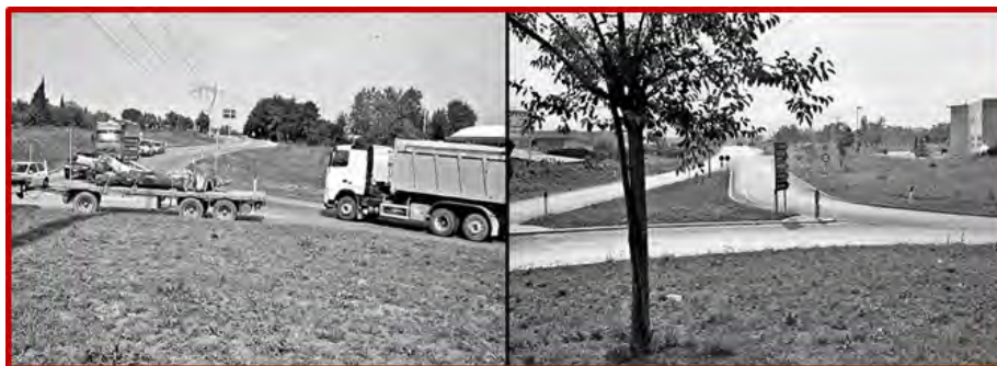
Figure 3: Nino Migliori, Via Emilia Crossroads, Provinciale, 136-49, 2005.

I think Via Emilia Crossroads was an undertaking that resulted in historical awareness, and I was part of that. This is the only road that has given its name to a region – it runs through the very center of the towns that have grown along its path and its identity has significantly shifted through time. Part of my work demonstrates this. For instance, we know that we are on the Via Emilia road when we read its name from a sign, but how many people are there who know that the two landmark towers of Bologna actually stand on the very path of the Via Emilia road? Moreover, there are stretches of this road running through what used to be open countryside and has now become heavily built-up areas over time. There are suburban stretches of the present-day Via Emilia that do not retrace its original path and have been laid out in recent times, like in some sort of “roadway diplopia” condition.